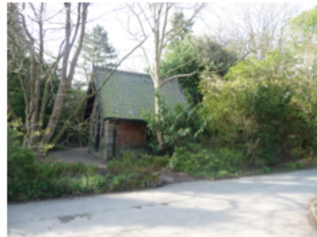
Area around the Pump Room needs refurbishment