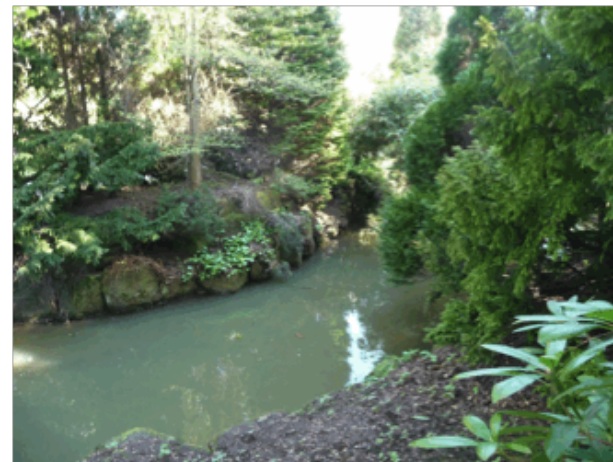
New open areas around the stream with new shaded view points