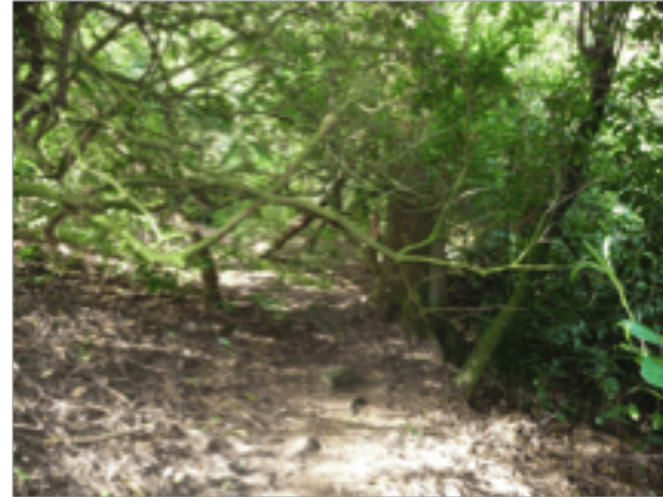
Existing path east of the duck pond