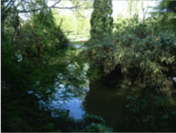
Stream near duck pond