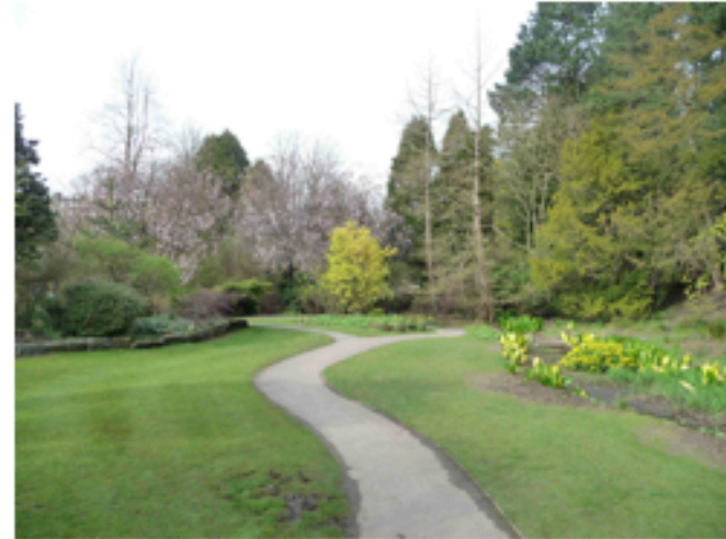
Entrance from west