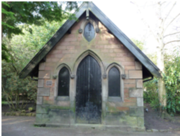
Magnesia Well Pump Room Today