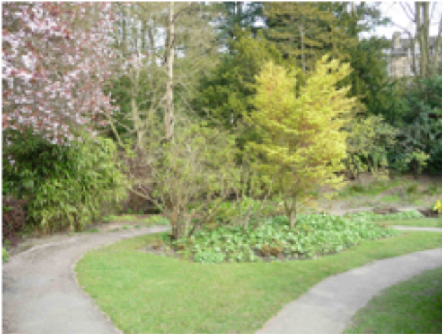
Entrance from east