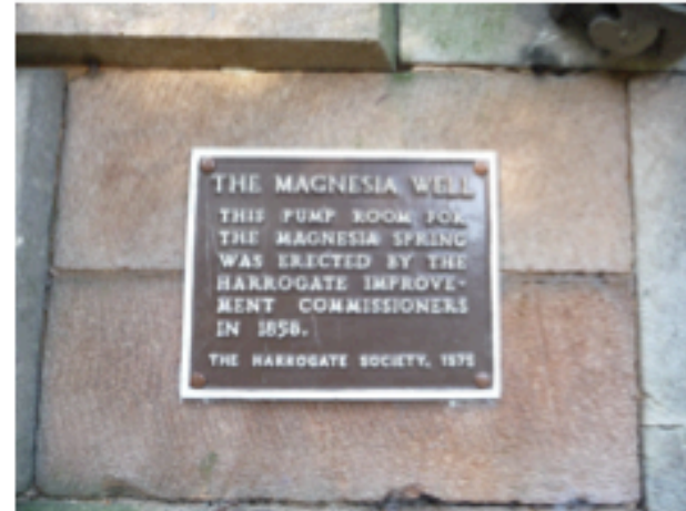
Magnesia Well Pump Room circa 1860