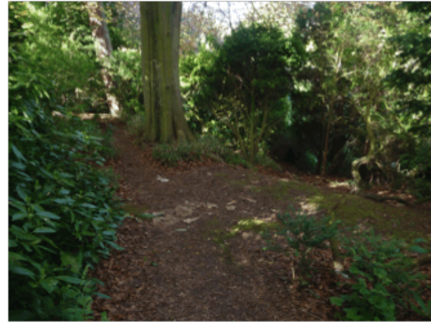
Entrance near Cafe. Foot paths already exist, but are little known and overgrown