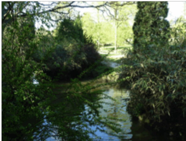
Duck Pond. A different perspective.