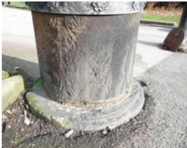
Existing Pillar is not in good shape.