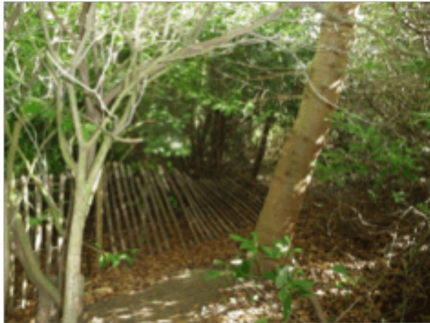
Entrance near Cafe. Fence in wooded area is falling down and serves no purpose