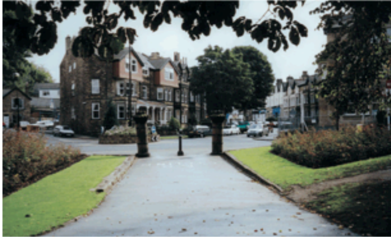
Entrance with 2 Pillars