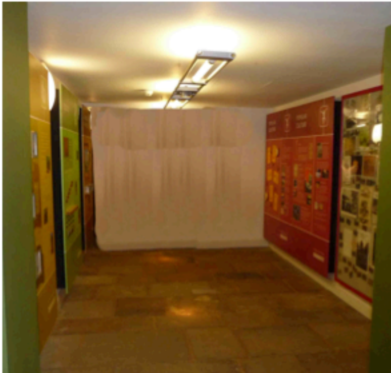
Possible Layout for Room