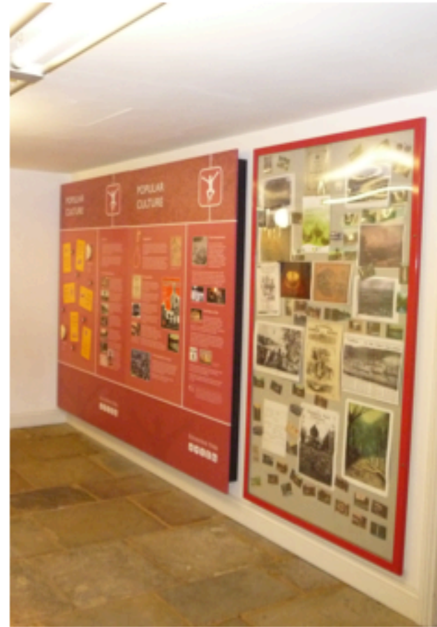
Typical Educational Boards